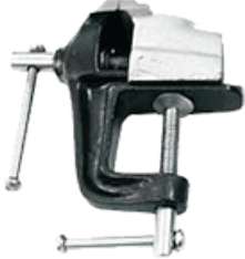
Table Vice with Clamp