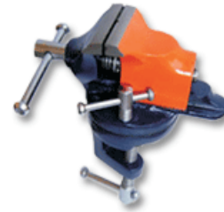
Table Vice Clamp Type Revolving